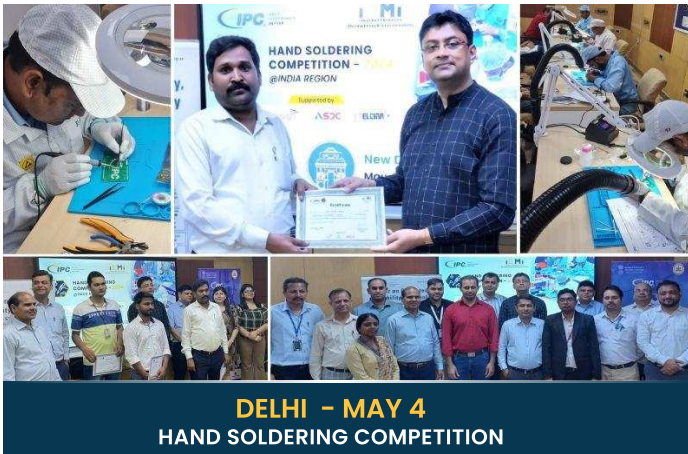
DELHI - MAY 4 HAND SOLDERING COMPETITION

Congratulations! IPC Hand Soldering Competition was held on May 4 at New Delhi for Northern & Eastern India electronics industry members. Winner from Syrma SGS Technology Limited & runner up candidates from Exicom Tele Systems Limited & Barco Electronic Systems Private Limited