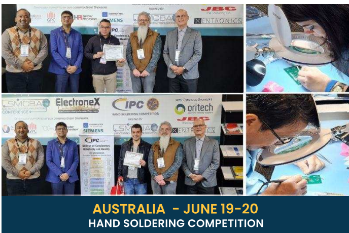
AUSTRALIA - JUNE 19-20 HAND SOLDERING COMPETITION

IPC organized a technical session & industry networking event at Dubai UAE on June 1. Hand soldering repair rework are critical parts of electronics manufacturing and IPC will be supporting members in UAE & MiddleEast through workforce skill development programs and industry forums bringing end-users and suppliers in one platform.