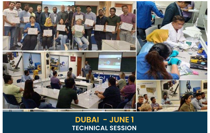
DUBAI - JUNE 1 TECHNICAL SESSION

Thank you sponsors JBC Soldering Tools Advance Tech Services Pvt. Ltd. Japan Unix Co.,Ltd. OFFICIAL and supporters Automotive Skills Development Council - India Electronics Sector Skills Council Of India (ESSCI) Aerospace and Aviation Sector Skill Council Electronic Industries Association of India-ELCINA